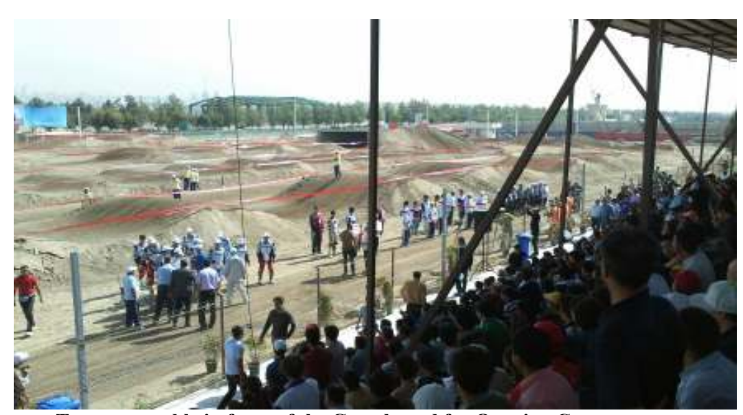
Teams assemble in front of the Grandstand for Opening Ceremony

Race day weather was perfect. Warm and dry. Track material was a sandy loam over clay material with no rocks. CoC Mehran Hemation, had carried out an excellent job of overseeing watering, however unfinished facilities for the two live TV broadcast segments induced delays in the program leading to cancellation of 2 National 65cc and 250cc races.