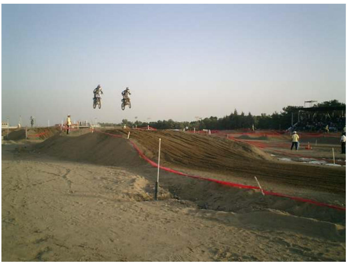
Riders loved the dust free track

Action aplenty at the front and just as much behind as Riders passed and re-passed, but at the finish of the 20 min plus 2 lap Moto, the top 3 only had completed 20 laps, the next 10 on 19 laps. One each on 18, 16, 15 laps respectively. Dilshod Rajabov from Tajikistan, struggling with SX sections was eliminated on the 75% factor while UAEMC De La Cruz retired on the 8<sup>th</sup> lap. 1<sup>st</sup> Tomoya-Japan. 2<sup>nd</sup> Khaliunbold-Mongolia. 3<sup>rd</sup> Amir Reza-Iran. 4<sup>th</sup> Ali-Iran. 5<sup>th</sup> Kenneth RP