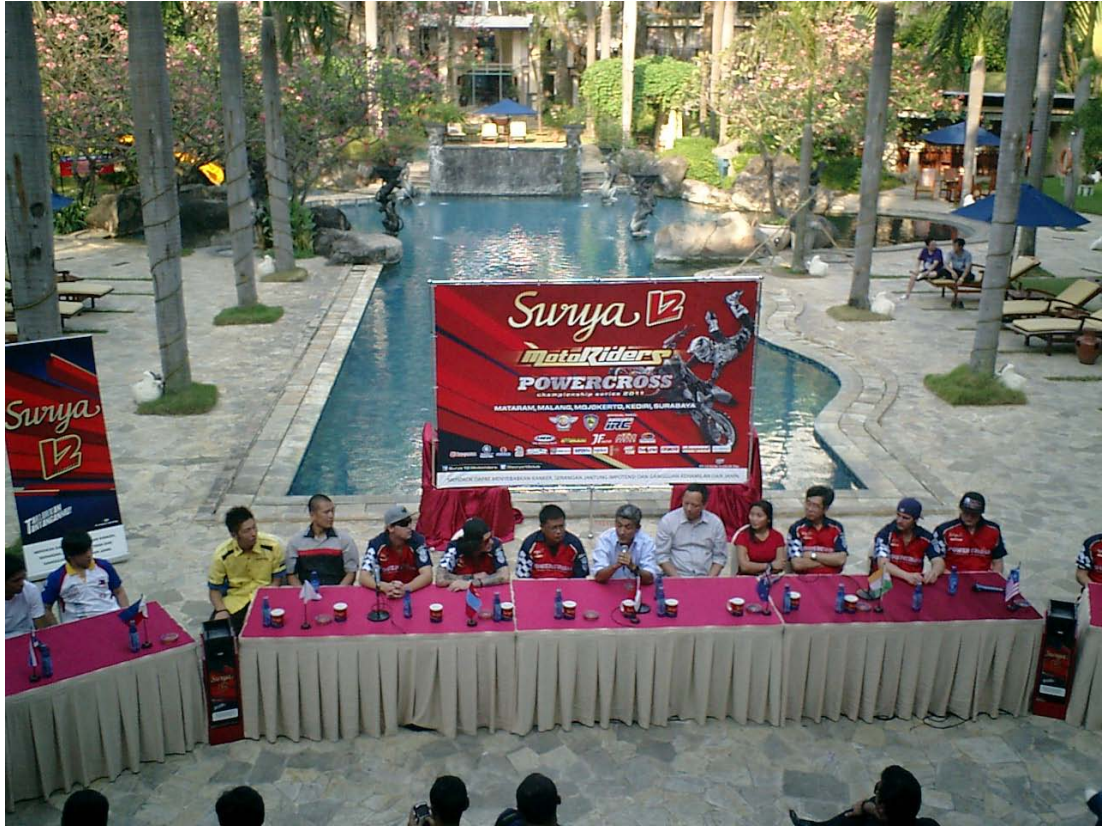
Press Conference at Official Novatel Hotel Surabaya

After a 3 year sojourn the AMSC returned to Indonesia, this time to the City of Surabaya for a night event at the full on Supercross 0.6 Km Ex Barata Circuit where local organisers had arranged spectacular entertainment including Freestyle MX, Music and Fireworks to support this event titled FIM Asia Motocross/Powercross Championship as Rd 2 AMSC.