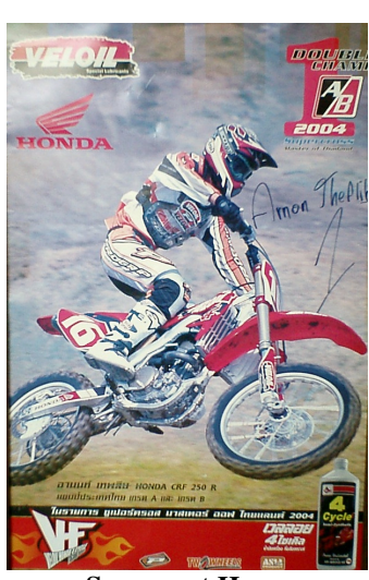
Success at Home