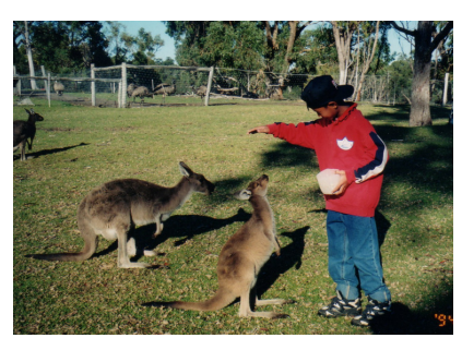
Making new Aussie friends