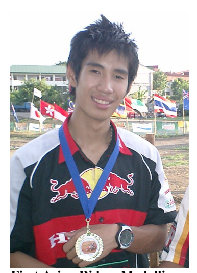
First Asian Riders Medallion MANILA