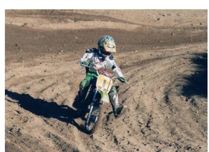
The Sandy Coastal Park Circuit